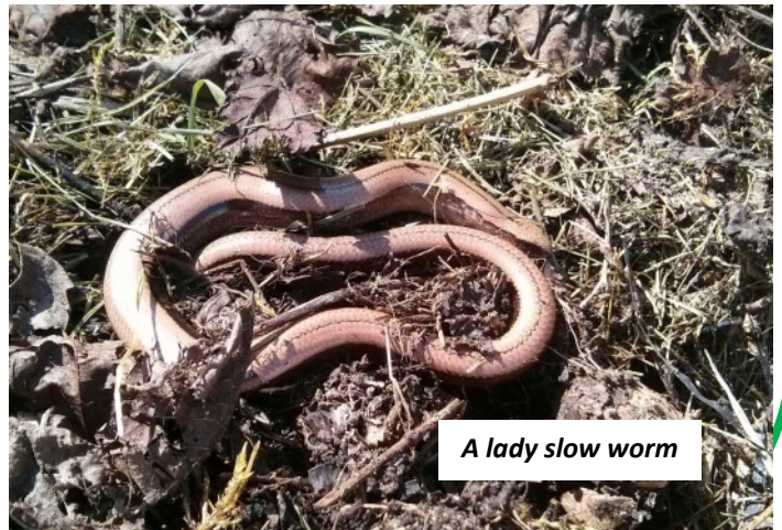
A lady slow worm