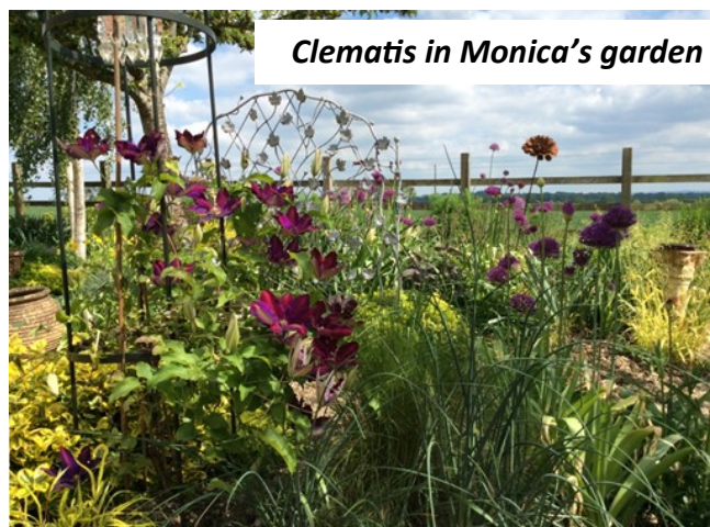
Clematis in Monica's garden

I've been breaking up large clumps of daffodils and replanting them. (I heel them in until I decide where I want them to be).