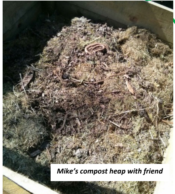
Mike's compost heap with friend

You will be attracting a whole range of friendly beetles,