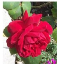
Tess of the Durbevelles