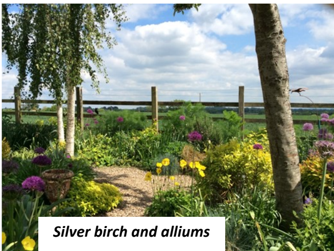
Silver birch and alliums

I look at the garden, with ideas in mind, as to what could be changed, so I have spent time splitting and replanting.