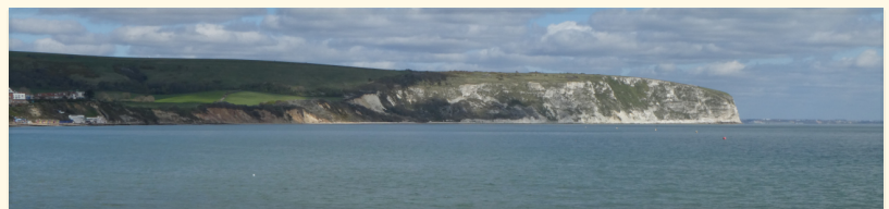
Swanage sea view