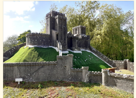
Corfe Castle model as it used to be