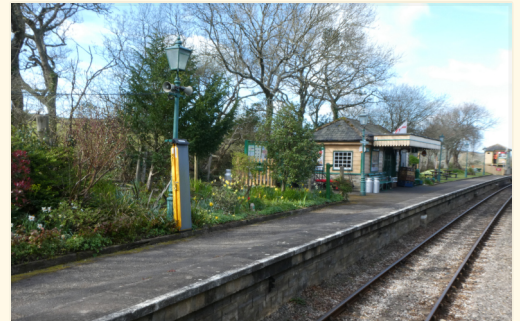
Harmen's Cross en route