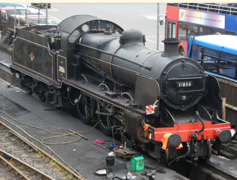
At Swanage class u 2-6-0 loco built 1928