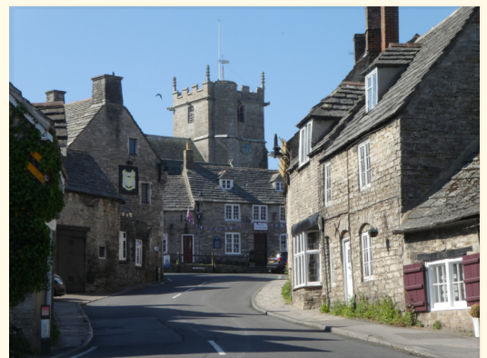
Corfe Castle village