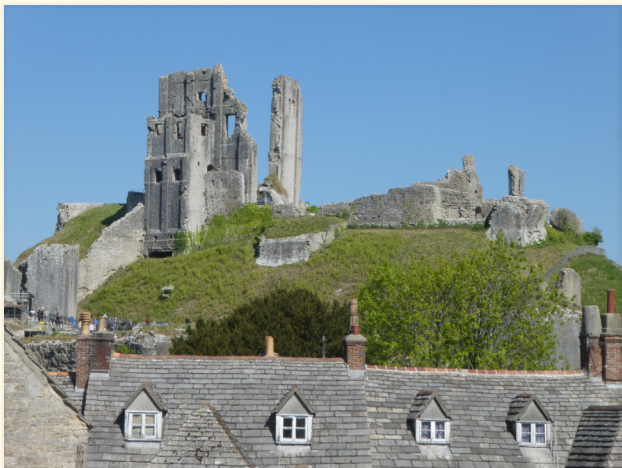
Corfe Castle from the village