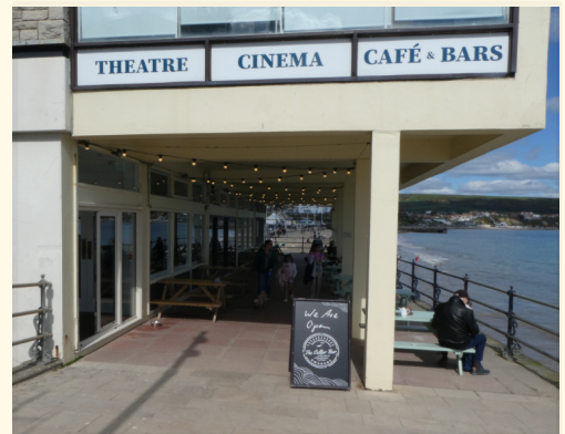
Swanage sea front near the cinema