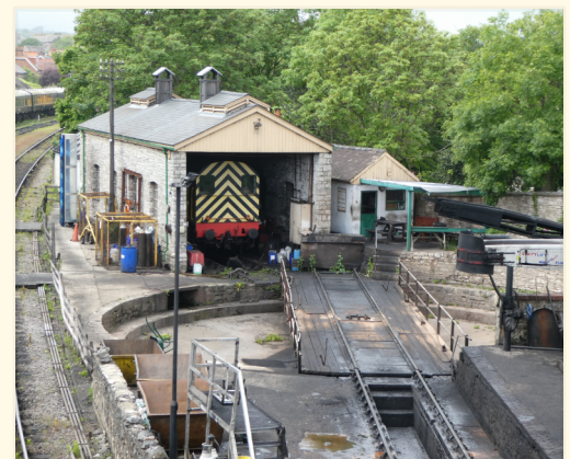
Swanage loco depo and turntable