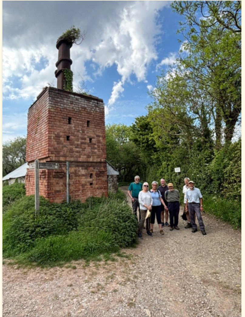
Members of the Geology Group at the disused retort (a device for distilling crude oil) at Kilve, north Somerset.

Closer to home, we have also examined the relationship between scenery, landscape and the underlying Geology in Somerset and Dorset as well as the impact of the Ice ages in the British landscape generally and particularly in the Southwest. A study of the tectonic history of the Bristol Channel was followed by a trip to Kilve (June 2025) where, as well as the Geology, we also looked at the industrial archaeology associated with one of the earliest attempts to develop an onshore oilfield in the UK (see photo). Early this year, we looked at range impact of storms on our coastline, with special reference to the destruction of the coast road at Start Bay in Devon.