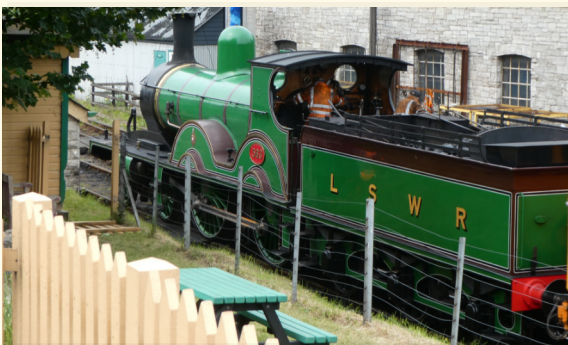
Swanage LSWR t9 4-4-0 loco built 1900