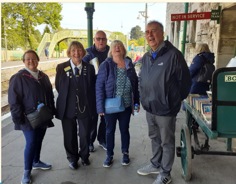
Corfe Castle station - well they've had a good day!