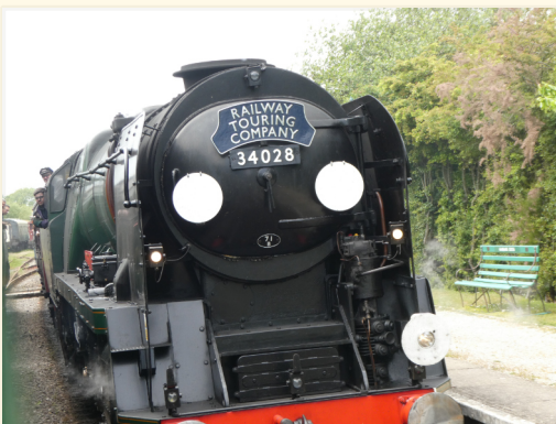
Eddystone a rebuilt West Country at Harmon's Cross