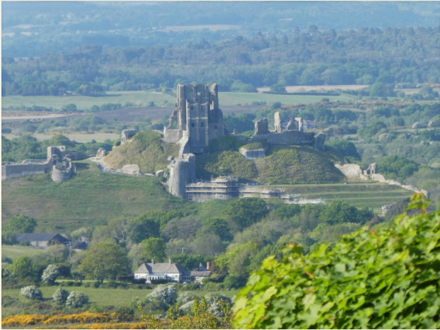
Corfe Castle from the hill