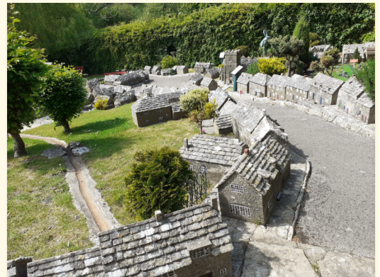
Corfe Castle model village