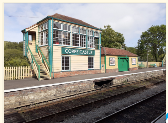
Corfe Castle station signal box